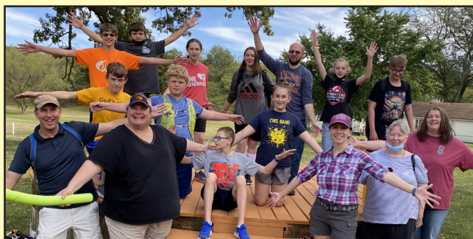
On Sunday, September 26th the Confirmation students attended a one-day retreat at Lutheran Outdoor Ministries Center (LOMC) in Oregon.