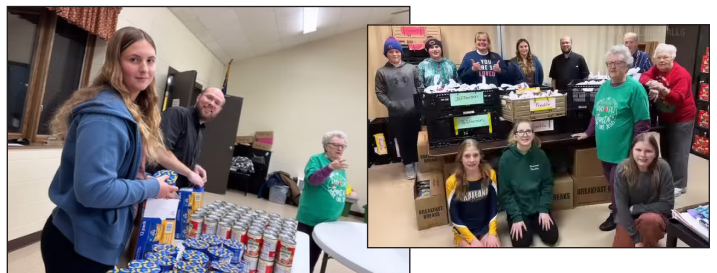
Thanks be to God for Buddy Bags!

Sunday School youth helped purchase Christmas gifts for children that were sponsored by the LSSI Holiday Hope Chest.